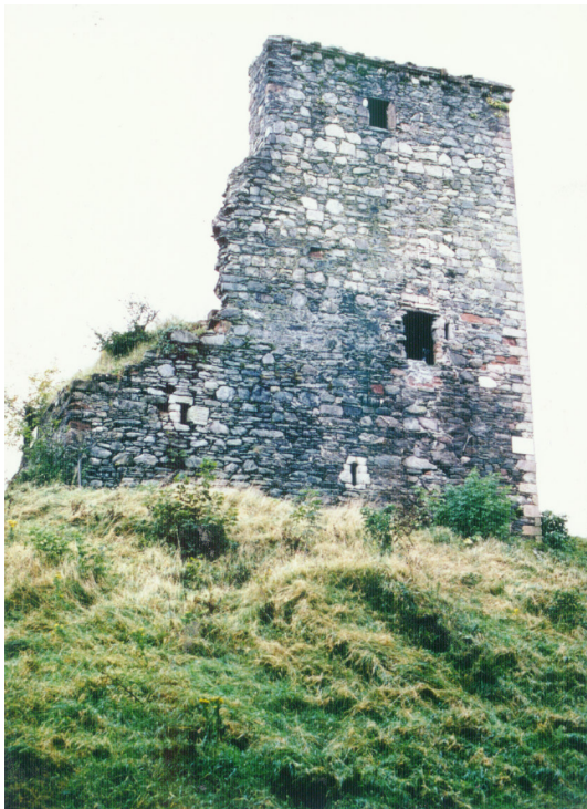
View of the tower from the South