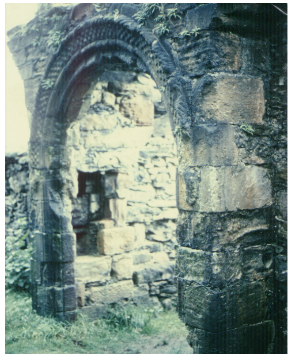
Entrance gate in the North wall