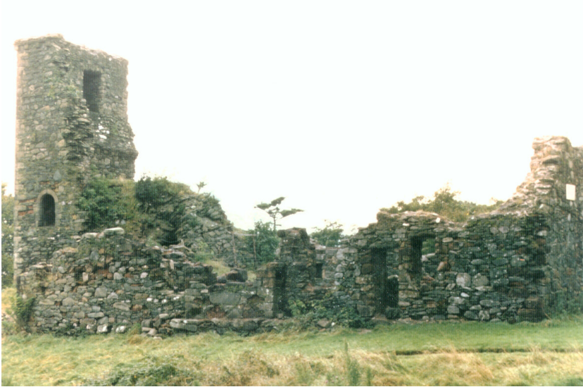
View from the East

Early castle of the Clan Chiefs. Built in the late 1400's by John VII, and originally of four stories. Visited by Queen Mary in July 1563. Located about 7 miles south of Dunoon. Note the many small stones in the wall construction. It was destroyed by the Campbells in 1646, resulting in the treacherous slaughter of 200 defenders. The Lamont Memorial in Dunoon commemorates that event